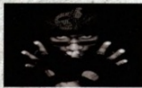
V SINISTER 1:30am - 1:50am