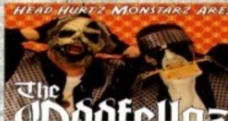
ODD FELLAS 5:30pm - 5:50pm