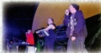
AZYLUM INVIATES 2:00pm - 2:20pm