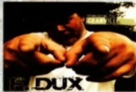
F DUX 1:00am - 1:20am