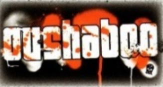
OUSHABOO 4:00pm - 4:20pm