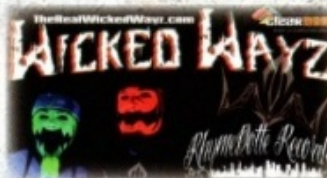
WICKED WAYZ 2:30pm - 2:50pm