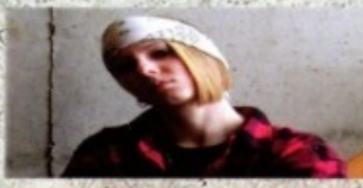
G-CHILD 5:00pm - 5:20pm