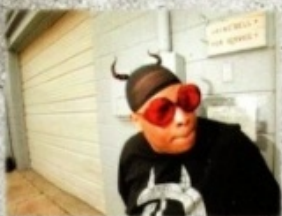
KING GORDY 3:30am - 4:00am