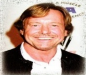
ROWDY RODDY PIPER