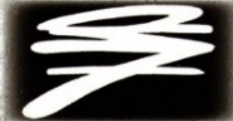
OS7 4:30pm - 4:50pm