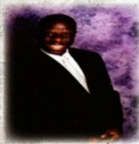
JIMMIE "JJ" WALKER