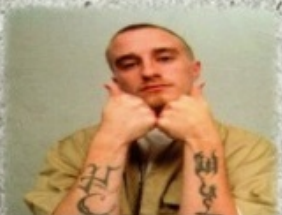
Lil WYTE 4:10am - UNTIL