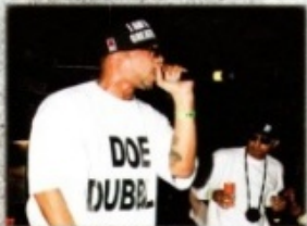
DOE DUBBLA 2:30am - 2:50am