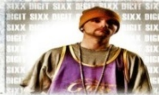
SIXX DIGIT 1:30pm - 1:50pm