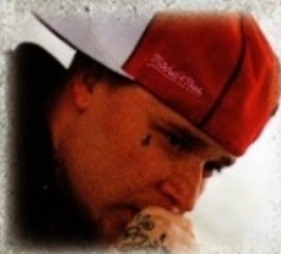
LIQUID ASSASSIN 3:00am - 3:20am